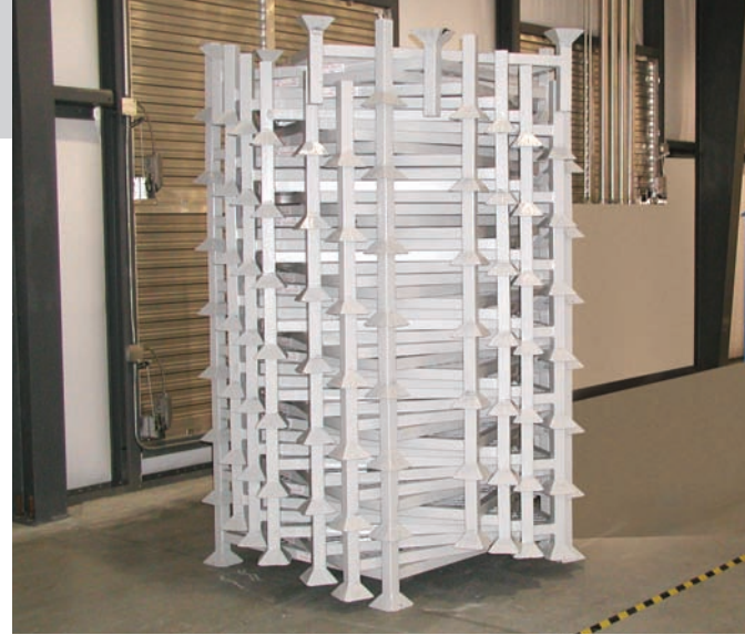
When not in use, Stacker Rack stores densely allowing you to use your floor space as needed